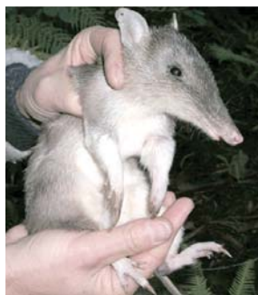
A Long-nosed bandicoot ( Perameles nasuta ).

After a spate of sightings, and discovery of the two sets of remains, a Long-nose Bandicoot has been trapped by WIRES in Lewisham near the goods railway corridor.