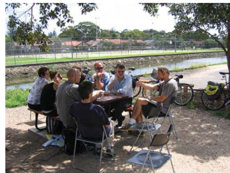
Attendees at the first GreenWay Think Tank at Hawthorne Reserve Leichhardt in early March.