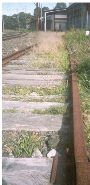
One of the two tracks of the Rozelle goods line has already become disused. What is the future of the corridor?

An important step in the future of the Cooks River to Iron Cove GreenWay vision was the formation late last year of the community group "Friends of the GreenWay".