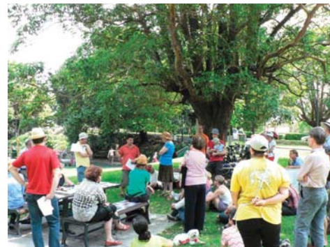
Friends' supporters gather at Hoskins Park Dulwich Hill in December 2007 to launch the group. See more on P.2

There has also been a lot of flurry in the media of extension of the light rail from Lilyfield to Summer Hill. But the media is yet to pick up on the huge potential for a GreenWay trail to not only boost numbers for the existing light rail service, but to have in place a "veloway" in the rail corridor from Summer Hill all the way to the Anzac Bridge cycleway at fraction the cost of a new light rail.